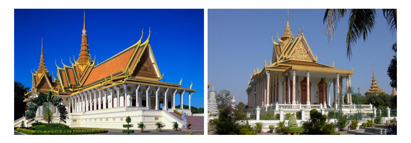
Royal Palace& Silver Pagoda