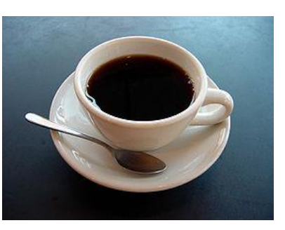
Have a rest!